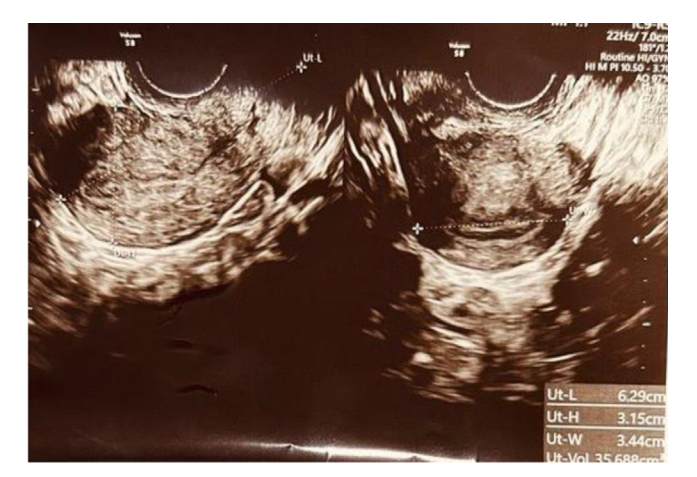
Figure 1: The TVS image showing mid-sagittal and transverse section of uterus measuring 6.29 * 3.15*3.44 cm.

Her ultrasonography revealed a normal size uterus with right ovary 2 antral follicle count (AFC) and left ovary four AFC (Figures 1 and 2).