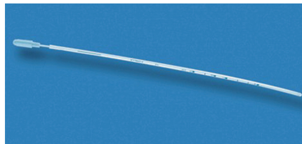
Figure 1: Pipelle endosampler catheter

Individualized protocols for both down-regulation and controlled ovarian stimulation were used.