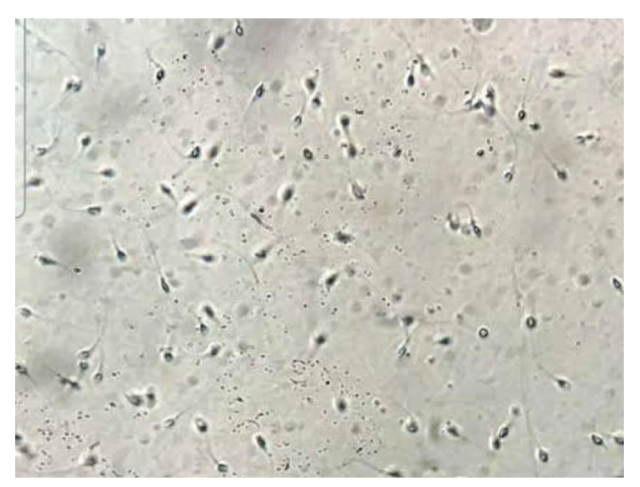
Figure 2: Sperms seen under magnification after teasing out the seminiferous tubules.

culture till day five of which one embryo got arrested. On the day of transfer two blasts with grades 412 and 312 (as per Istanbul Consensus grading) were transferred.