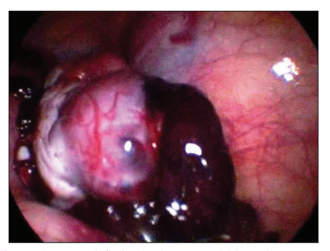
Figure 1: Laparoscopic finding showing a ruptured right ovarian pregnancy

Ovarian ectopic pregnancy is mostly confused with tubal ectopic pregnancy and ruptured corpus luteum cyst as all the three of the above conditions have the same clinical picture and presentation. In ovarian ectopic pregnancy, the patient usually presents early in gestation as the ovary can accommodate the gestation for a short duration as the tunica albuginea is weakened by the invading cytotrophoblast. Due to the increased