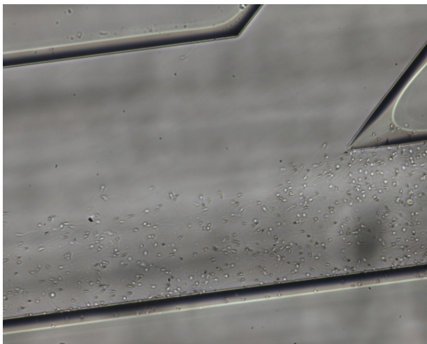
Figure 2: The amount of medium in chamber B was adjusted such that the width of the laminar flow from chamber A was approximately 40% of the overall width of the central microchannel

This paper has presented a systematic review of the effects of microfluidics on sperm motility, morphology, and integrity over the past 20 years since the idea of microfluidics was developed two decades